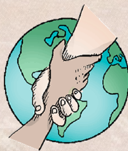
WORLD HUMANITARIAN DAY

To show our support and bring awareness to ESG calendar events, we will be honouring World Humanitarian Day. This will take place on Monday 19th August 2024. More details to follow!